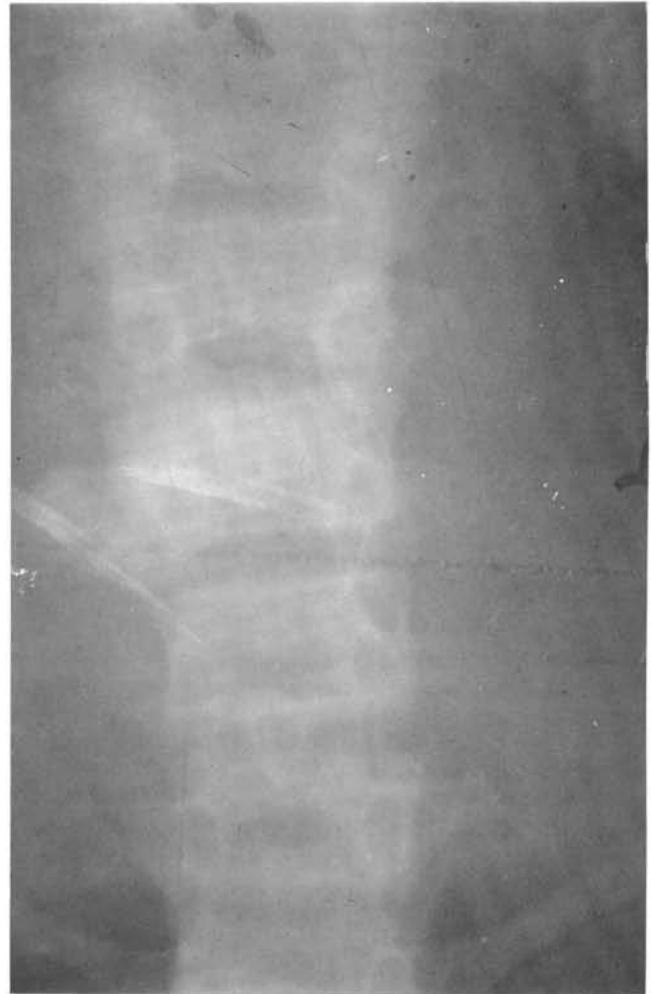
Figure 1 - X-ray of lumbar spine showing bone sclerosis of the left side of the L3 vertebral body, which had a large transversal process.

Muscular involvement with clinical or radiologic expression is not common, being found by tomography in only 5% of the 400 cases of non-Hodgkin lymphoma in the Glazer et al. series (4) and in 5.4% of the 110 cases