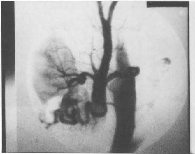
Figure 1 - Percutaneous retrograde abdominal aortogram demonstrates dilated right renal artery, winding stump of the renal vein, and opacification of inferior vena cava.

Among the cases of hypernephroma, there frequently existed both a connection of large artery to the vein due to tumor invasion, and large communicating vascular spaces within the partially necrotic tumor. 4 In the remaining cases, the initial lesion probably was an arterial aneurysm which eventually eroded the wall of the vein to form the connection, but this condition is rare. 4,11