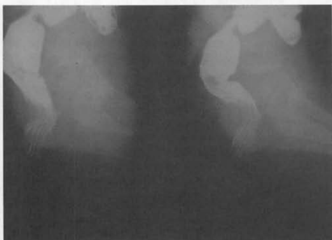
Figure 2 - Absence of external sphincter tightening in incontinent patient.