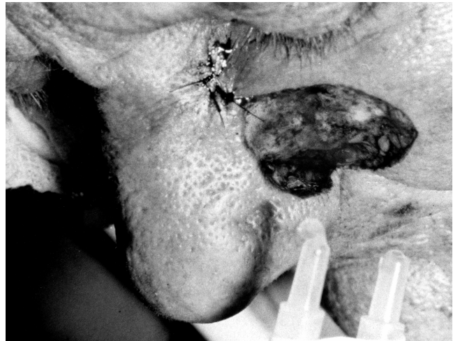
Figure 1 - Case 5: collocation of thrombin and fibrinogen, after the excision of cutaneous tumor (BCC).

Once the above criteria were defined, patients were submitted to exeresis around the injury, with a 4.0 mm