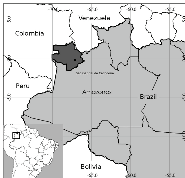
Figure 1 Map of Upper Rio Negro region, State of Amazonas, Northern Brazil.

the variables race/color, sex, marital status, and age. The clinical-epidemiological description was performed from the variables place of death (home, hospital etc.), basic cause of death, and day of the week (weekend, Friday through Sunday; and non-weekend, Monday through Thursday). Descriptive analyses were performed taking into account relative frequencies, absolute frequencies, and measures of central tendency. Data entry and analysis were made using the SPSS software, version 9.0.