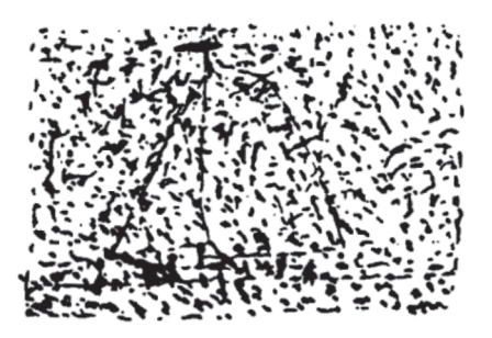
Figure 1 Two images from the Snowy Pictures cognitive task. The left one has only noise; the right one includes an embedded boat.

For the mediums group only, we asked about frequency and length of possession experiences. We measured frequency by asking how often they were possessed by a spiritual agent, assessed on a seven-point rating scale (every day, more than once per week, once per week, once per month, a few times per year, once per year, rarely); for length, we calculated how long they had had this experience in years (current age minus age of first experience). In addition, we asked how much control they had over their bodies during the possession experience (rated as no control at all, a little control, partial control, total control); how personally meaningful they felt the possession experience to be, rated from "not at all" (0) to "extremely" (10); and the level of fusion with the spiritual entity, rated on a seven diagram scale with two circles representing the self or the spirit and showing increasing levels of overlap.30