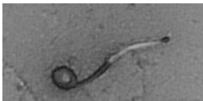
Figure 6. Tail abnormality of a rhea spermatozoon. Optical microscopy, 1000x magnification.

The analysis revealed wide variety of morphological changes, such as bent head, folded tail, strongly folded tail, strongly coiled tail, coiled tail, retroaxial insertion. Celeghini (2000) described some sperm morphological abnormalities in cockerels, such as acrosome, head, midpiece, and tail defects, protoplasmic droplets, isolated heads, and teratological abnormalities, similar to those found in rheas in the present study. The staining methods of Williams and Fast Panótico 4 ® used for the morphological evaluation were efficient; however, the first stained the cells more clearly, improving the identification of morphological abnormalities. The Fast Green / Rose Bengal staining (Pope, Zhang, Dress, 1991), used with fresh semen, clearly highlighted rhea sperm acrosome in a dark violet color. Some problems were found when using vacuum blood collection tubes (Vacutainer ® Systems). During collection, the restraining technique still allowed the bird some leg movements, and whenever that happened, the tube lost the vacuum. Therefore, 30X8 mm needles were manually arched and coupled to 5-ml syringes. Birds with large phalluses had higher testosterone levels as compared to those with smaller phalluses (Table 1).