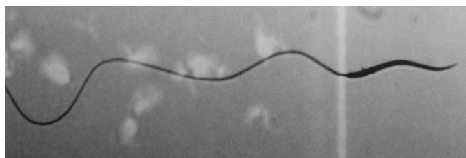
Figure 5. Optical microscopy of Rhea spermatozoa (1000x magnification).

To our knowledge, this is the first report on sperm morphological abnormalities in rheas, and thus, a comparison with previous studies was not possible. It was also difficult to classify sperm abnormalities, and therefore, parameters of sperm evaluation developed for domestic fowl were used. Sperm morphology was similar to ostriches, with sperm showing a cylindrical shape divided in head, midpiece, and tail (Figures 5 and 6). The head has a very evident acrosome; the tail consists of a main piece and end piece.