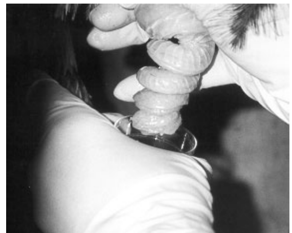
Figure 3. Phallus exposed and semen collection on a Petri dish.