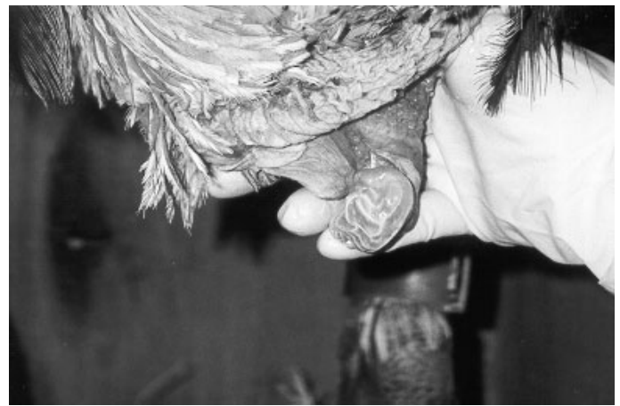
Figure 2. Phallus eversion and massage.

Semen collection was performed by the gloved-hand technique in the cloacal region. The phallus was exposed by eversion of the opening of the cloacal region (Figures 2 and 3). Subsequently, the phallus was inspected and measured. After this procedure, erection was achieved by digital manipulation on the basis of the phallus. Semen was collected in a Petri dish placed on the farthest portion of the phallus, where the semen flowed through the phallic groove. The ventral neck of the bird was sometimes massaged to facilitate ejaculation.