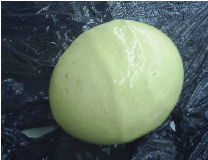
Figure 1 - Stress lines in the eggshell of an ostrich egg.

Twenty embryonated eggs from ostriches with reproductive disorders were transported to the laboratory for bacteriological examination. Thirteen eggs were in the first half of the incubation period (1-21 days) and seven eggs were in the second half of the incubation period (22-42 days). All eggs presented stress lines (Figure 1), and the quality of the eggshells was poor, with deformities and high porosity, resulting in embryonic death (Figure 2). The eggs were produced by ostriches housed in farms with no history of health, nutritional or management failures that might justify those symptoms.