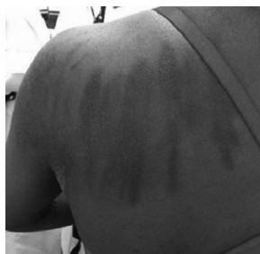
Figure 1 – Flagellate dermatitis in upper back, with hyperchromia and a “whip-like” pattern.

After administration, a hydrolase enzyme metabolizes bleomycin. This enzyme is almost not found in skin and lung tissues which may explain the accumulation and consequent