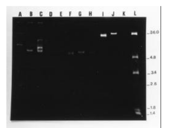
Fig. 1A. Agarose gel electrophoresis of Acinetobacter baumannii plasmid DNA extracted by the method of Kado & Liu (1981). Lane A: strain from enteral solution; Lanes B to H: strains 1,6,9,10,11,12, and 13 respectively; Lanes I to L, standard plasmids: RP4 (34MDa), JPN11 (66 MDa), R27 (110MDa), V517 (standard plasmids from Escherichia coli 517).

Typing of A. baumannii: Table 2 presents a correlation among the typing results, sampling site, and period of strain isolation. Six strains were isolated during April, five of them from catheter tips and one from skin secretion; all those strains belonged to biotype 2 and, with the single exception of one plasmidless strain, they all presented plasmid profile II (absence of the 66 Mda plasmid) and antibiotic resistance pattern A. Eleven strains isolated from June to September belonged to biotypes 2 and 19 and, excepting one plasmidless strain, all of them presented plasmid profile I(presence of the 66 Mda plasmid) and antibiotic resistance pattern B. The ratio of strains isolated from skin to isolates from catheter tips changed from 0.2 (1/5) during April to 1.2 (6/5) during June to September.