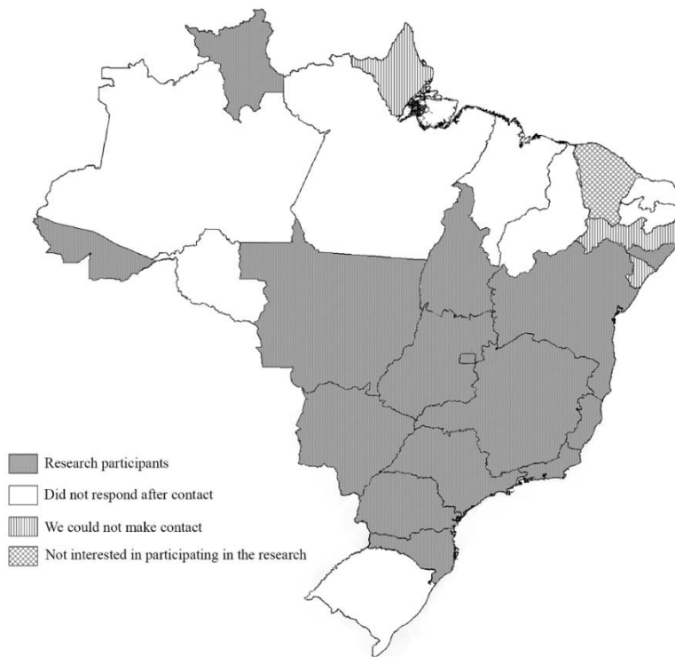
Figure 1. Federal units of Brazil participants and non-participants of the research.

With regard to the experience of the forensic experts with plant traces and their familiarity with sub disciplines of Botany, there were remarkable results considering the reality of the Brazilian forensics. From the total of experts interviewed (35), 39% already had contact with or have knowledge about plant traces being a useful evidence in environmental crimes, crimes against person and/or drug traffic. This result reinforces the importance of including botanical evidence in forensic investigations 17,18 , as well as suggests a demand for the inclusion of this type of evidence in Brazilian forensic reports.