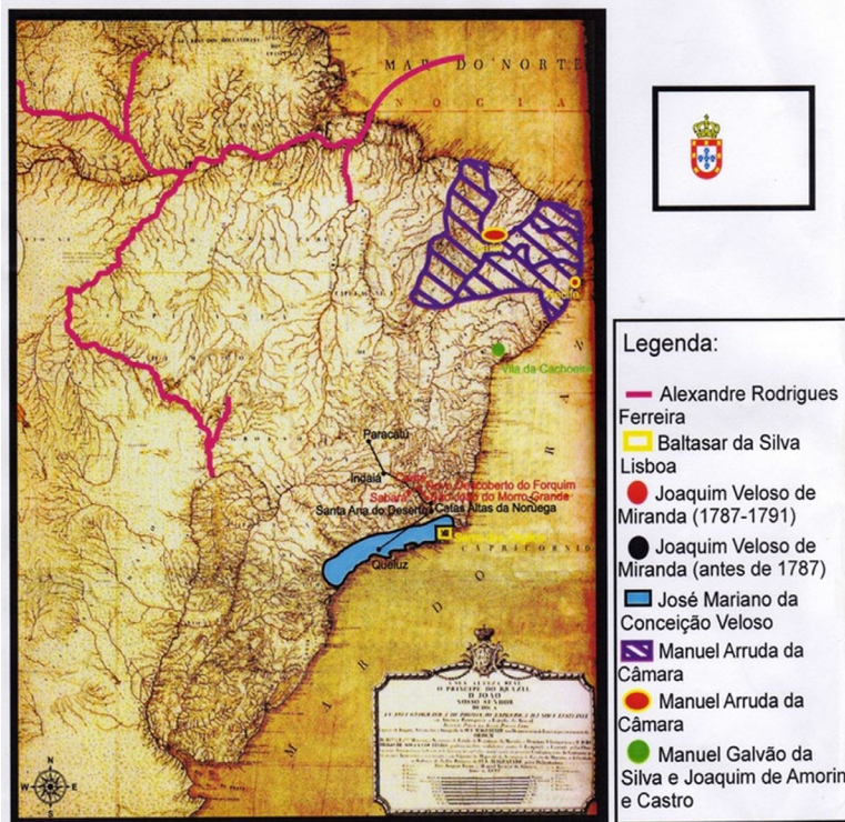
Figure 1: Demonstration map of the routes taken by travelers under the administration of Martinho de Melo e Castro (1777-1795).