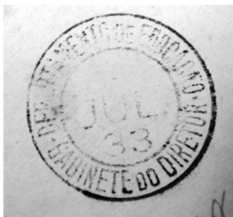
Figure 3 – Stamp in the copy belonging to the Paulo Bourroul Collection