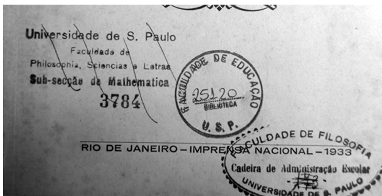
Figure 2 – Stamps on the copy belonging to the School of Education/University of São Paulo (FE/USP)

Source: Alves (1933). Collection of the library of the School of Education/University of São Paulo (FE/USP).