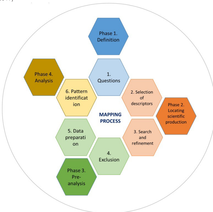
Figure 1- Systematic mapping process adapted from Petersen et al. (2008) and Sinoara, Antunes and Oliveira (2017)

To define the methodological route of this study, the proposals of Petersen et al. (2008) and Sinoara, Antunes and Oliveira (2017) were adopted. The design was structured in six steps organized into four methodological phases. Figure 1 schematizes the mapping process. Subsequently, each of the phases is detailed.