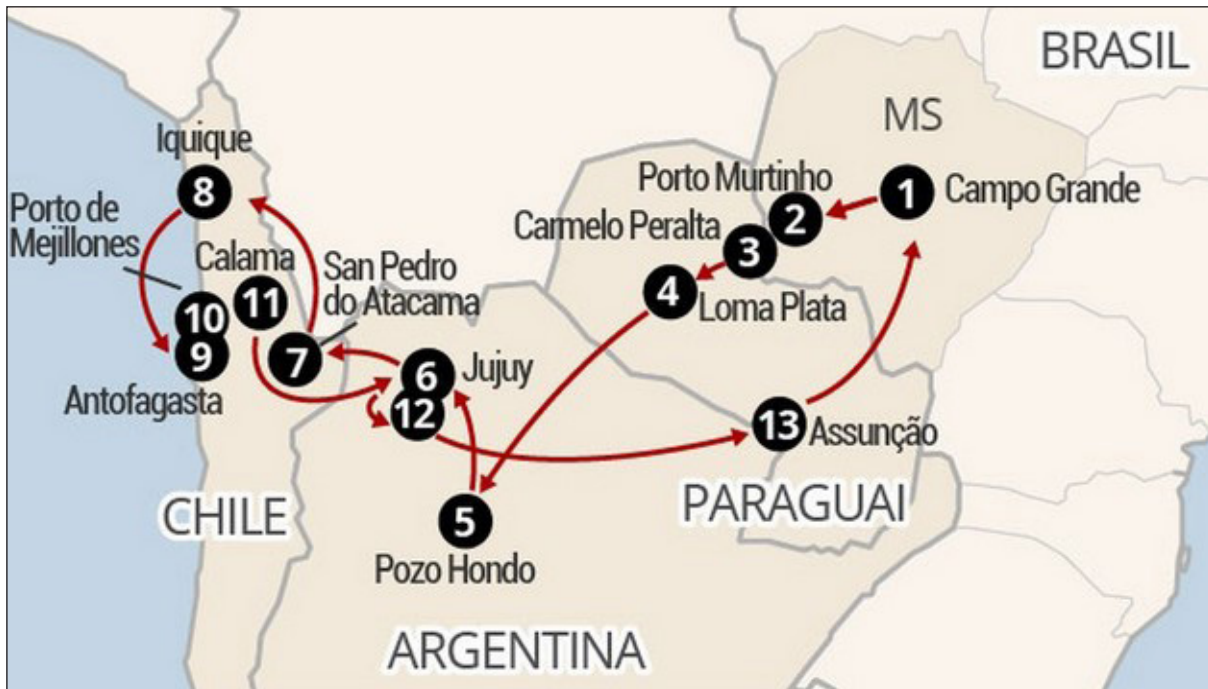
Figure 1 – Path of the Latin American Integration Route (RILA)

Source: Viegas (2017 apud ASATO et al. 2019).