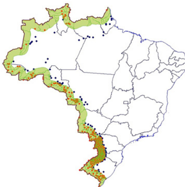
Figure 1 – Brazilian border strip