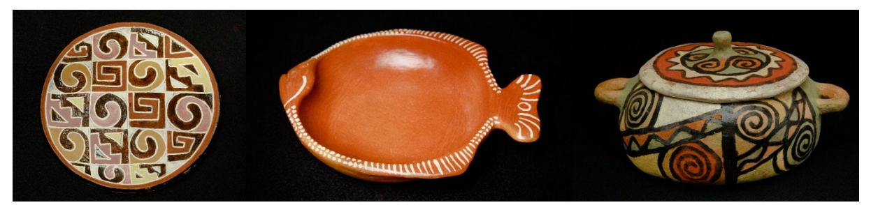
Figure 3 – Indigenous Ceramic Pieces: Kadiwéu (left), Terena (centre) and Kinikinau (right)

There are many shortages of indigenous handicrafts. Taking ceramics as an example, the flagship in the artisanal production of the Kadiwéu, Terena and Kinikinau ethnic groups, obstacles that limit both the production and the commercialization of artifacts can be pointed out.