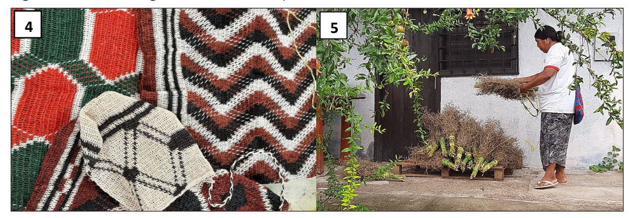
Figures 4 and 5 – Indigenous handcrafted pieces marketed in Porto Murtinho