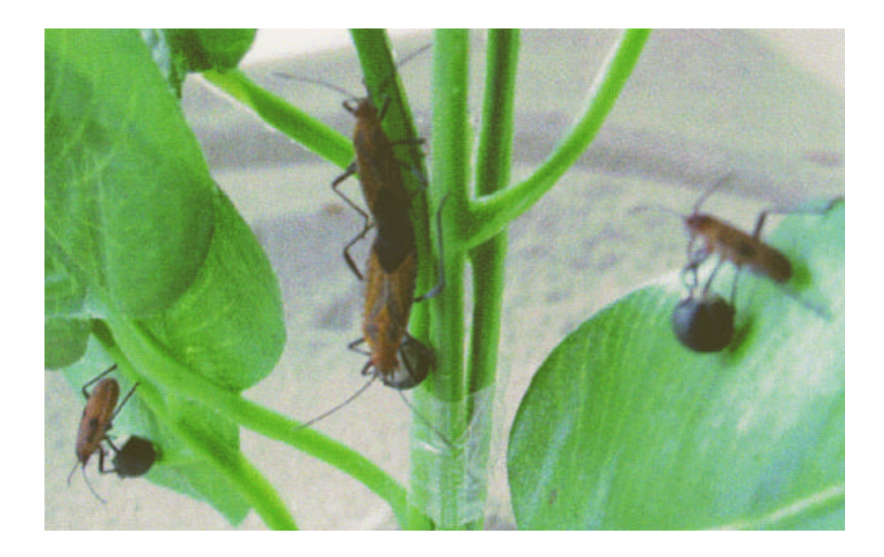
Figure 3. Adults of J. choprai carrying seeds of balloon vine, C. halicacabum , on a plant model (artificial plant) in the laboratory.

feeding insect and microorganisms on velvetleaf ( Abutilon theophrasti ) seed availability. Weed Sci. 37: 211-216.