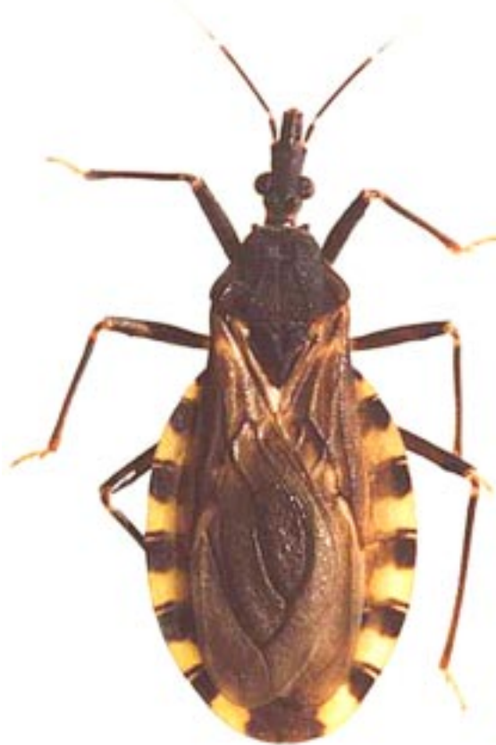
Figure 2. Triatoma infestans (Klug), dorsal view.

Overgeneralization may account for some of the ambiguity and apparent contradiction in the literature. The biology and ecology and behavior of many different species of Triatominae have been, and are being, studied individually, and there may be a tendency to generalize from each study to other species and even genera. If so, the generalizations will be contradictory just to the extent that a studied species differs from those to