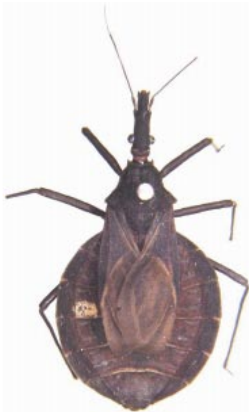
Figure 1. Linshcosteus karupus Galvão et al. , dorsal view.

4) Ancestry of Linshcosteus . If Linshcosteus is indeed a triatomine, from what triatomine ancestor has it evolved? If it has evolved from T. rubrofasciata , as the results of Hypša