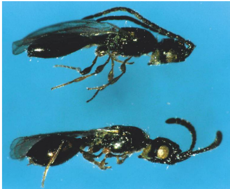
Figure 2. Adults of Coptera haywardi Loiacono, about 16 x; male (at the top) and female.

In 1997 C. haywardi was discovered in Venezuela attacking pupae of A. serpentina and A. striata Schiner whose larvae were reared in fruits of Chrysophyllum cainito (L.) and Spondias mombin (L.) (García & Montilla 2001). In the laboratory this parasitoid was able to develop in pupae of A. obliqua (Macquart) (García & Montilla 2001). A study on the bionomics of pupal parasitoids of tephritid fruit flies showed that C. haywardi developed in four species of Tephritidae [ A. suspensa , A. ludens , Ceratitidis capitata (Wiedemann) and Toxotrypana curvicauda (Gerstaecker)], but not in species of other families (Muscidae, Calliphoridae, Tachinidae and Drosophilidae) (Sivinski et al. 1998). Unlike many common, polyphagous, ectoparasitic, pteromalid and chalcidoid pupal parasitoids of cyclorrhaphous Diptera, C. haywardi develops as an endoparasitoid (Sivinski et al. 1998), and this could explain its narrower host range (Godfray 1994). According to Muesebeck (1980), species of Tephritidae are the most common hosts of Coptera species.