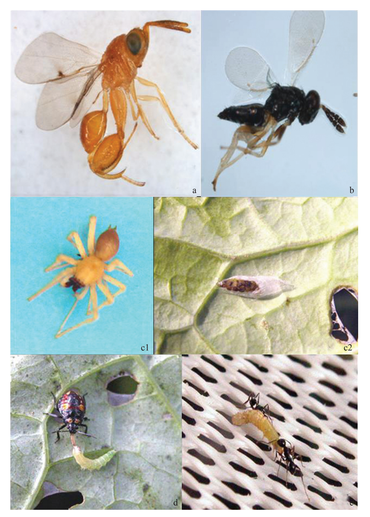
Fig 2 Species of natural enemies collected parasitizing or preying upon Plutella xylostella larvae in the field. Conura pseudofulvovariegata emerged from DBM pupa (a); Tetrastichus howardi emerged from DBM pupa (b); Cheiracanthium inclusum (c1) and DBM pupa attacked by C. inclusum (c2); Podisus nigrispinus nymph preying on larvae (d), and Pheidole sp. attacking larvae (e).