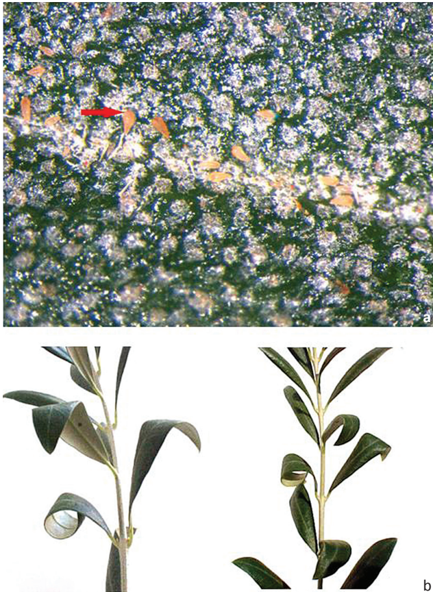
Fig 2 The olive bud mite, Oxyencus maxwelli : a) Live specimens on the upper leaf surface; b) Symptoms on leaves.

southern Maria da Fé, MG. That could have occurred long ago and the mite could have remained unnoticed because of the small size and, so far, inexpressive damage.