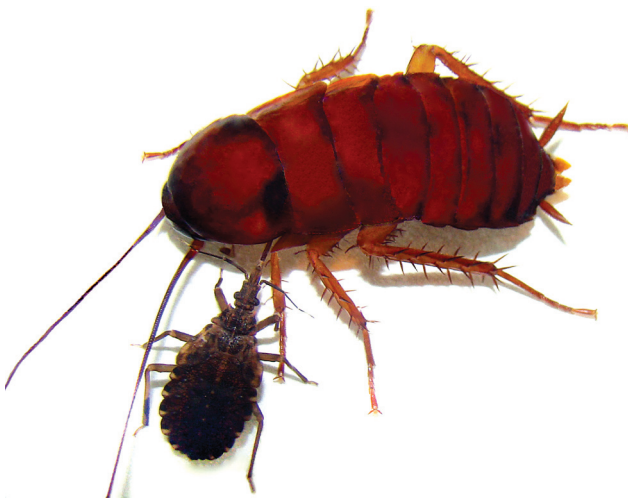
Fig 1 Triatoma pseudomaculata fifth instar nymph attempting to feed on a cockroach, Periplaneta americana .

Triatomines directed their bite attempts to all parts of the cockroach body, but the choices were not random (Fig 2, Kruskal-Wallis, P = 0.035). The most frequently bitten body parts were the legs and head, but a significant difference was only observed between the number of bites on the legs and the thorax (Fig 2, Dunn's post hoc multiple comparison, P < 0.05). The head, antennae and legs are structures that exhibit many sensory, integrative and motor components of the nervous system and concentrated 80% of the bites. Additionally, it is known that triatomine saliva contains substances that affect nerve cell responses (Dan et