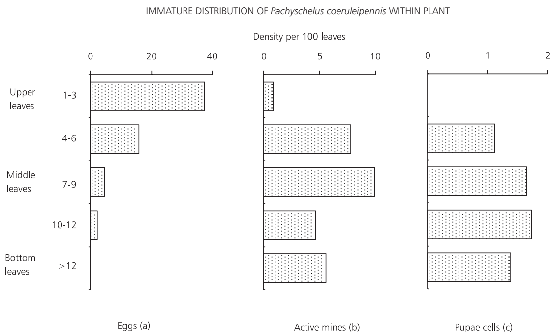
Fig. 2 — Densities of immature leafminers within five classes of leaf position (three leaves per category) recorded in February-March/1999 on shrubs of C. floribundus in SE, Brazil. (a) only eggs oviposited during 1 month (observed at 5-days interval) are represented, (b) mines with larvae still feeding, and (c) pupal cells, see that they were not found in the top class of leaf position.