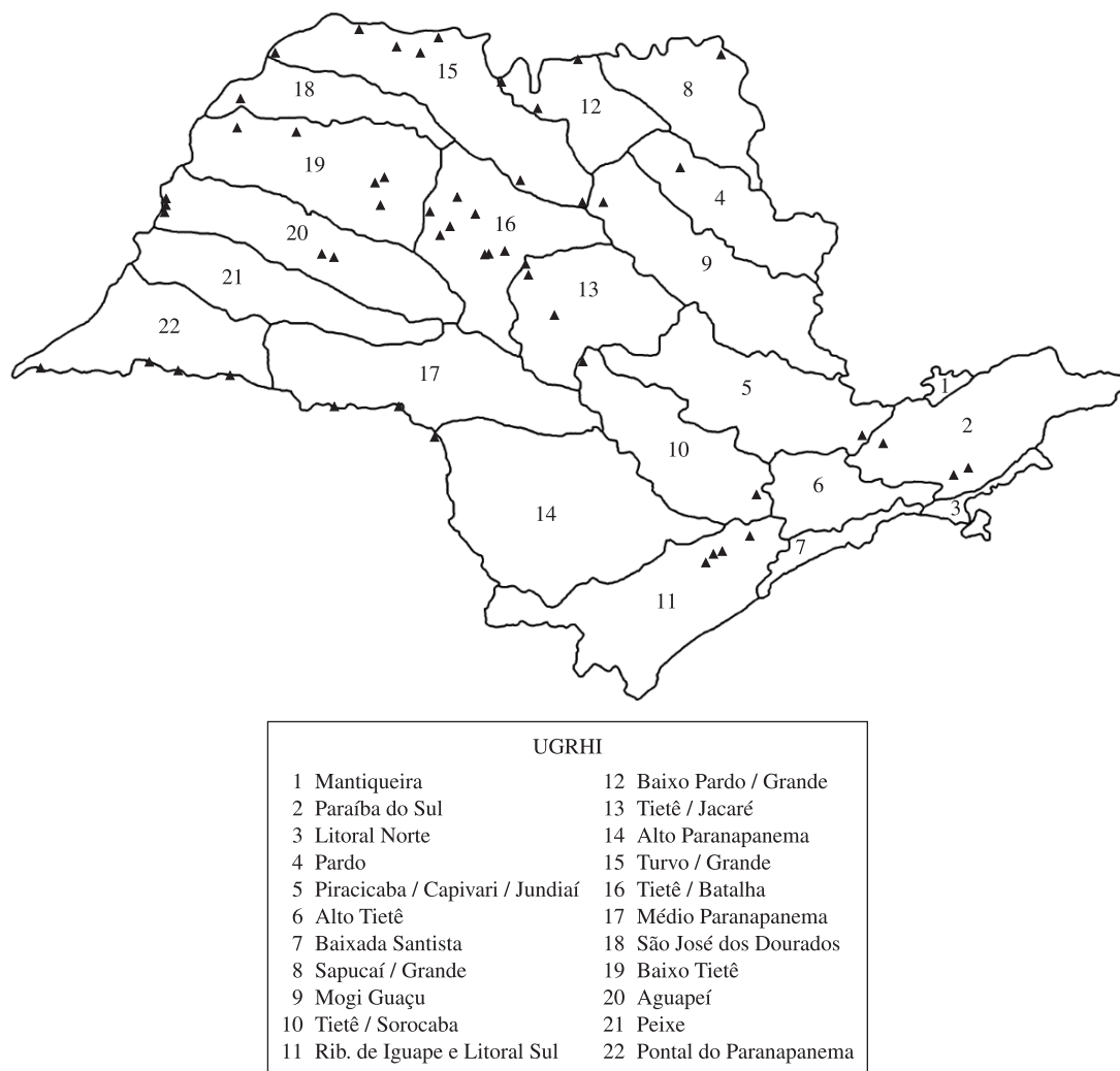
Figure 6. Geographical distribution of Notodiaptomus oliveirai spec. nov. at the 22 UGRHI of São Paulo State.

found in several reservoirs of Paranapanema basin (Rosana, Taquaruçu, Salto Grande, Rosana, Canoa Grande, Tavares, Jurumirim, Capivara, Chavantes reservoirs); Tietê/Jacaré basin (Bariri, Ibitinga, Barra Bonita reservoirs); Sapucaí/Grande basin (Jaguara, Igarapava reservoirs); Piracicaba/Jundiá/Capivara basin (Paramirim, Igarata, Cachoeira reservoirs, Lagoa Pousada); Tietê/Sorocaba basin (Prainha reservoir); Paraíba do Sul basin (Paraibuna reservoir); Ribeira do Iguape basin (Porto Raso, Serraria, Alecrim, Cachoeira da França, Barra reservoirs); Tietê/Batalha basin (Ibitinga, Promissão reservoirs, Tietê Rivers); Baixo Pardo/Grande basin (Porto Colombia, Marimbondo reservoirs); Turvo/Grande basin (Água Vermelha reservoir and Rio Grande river); São José dos Dourados basin (Ilha Solteira reservoir, São José dos Dourados river); Lower Tietê River basin (Nova Avanhandava, Três Irmãos reservoirs); Aguapeí basin (Paraná River, in some ponds). Figure 6 shows the geographical distribution of Notodiaptomus oliveirai in 22 UGRHIs (Unidade de Gerenciamento de