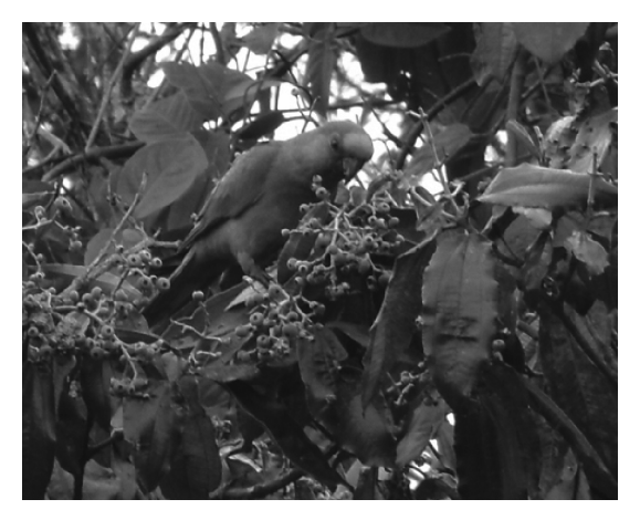
Figure 3. Aratinga aurea feeding on Miconia albicans fruits.

During the survey, the predation of a Tangara sayaca that was consuming M. albicans fruits, by a Callithrix jaccus (Linnaeus) (Cebidae) was observed. At 6:45 AM, three adult marmosets came to a M. albicans treelet and kept inside