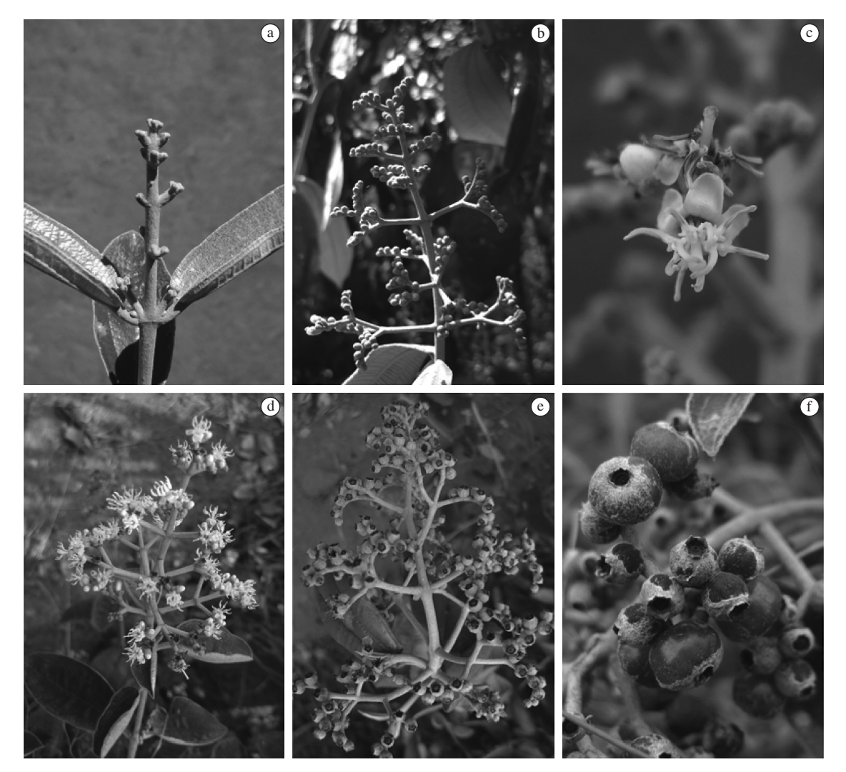
Figure 1. Miconia albicans phenophases. a,b) flower buds, c) flower, d) inflorescence, e) immature fruits, f) immature and ripe fruits.

According to Dias, Branco and Francisco (in press), a total of 274 bird species have already been sighted in the campus area, and 33% are believed to consume fruits, at least sporadically (Francisco and Galetti, 2001). In research performed with woody species in the area, M. albicans appears as the fourth most abundant species (Oliveira and Batalha, 2005).