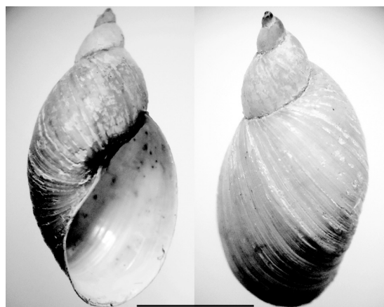
Figure 1. Lymnaea columella (Say, 1817): photograph of a specimen collected in wetlands from Instituto Federal de Educação, Ciência e Tecnologia do Espírito Santo (IFES), in the Caparaó microregion, state of Espírito Santo, Brazil. Scale = 5mm.

A total of 2038 molluscs were collected. Of these 1558 (76.45%) belonged to the genus Lymnaea (d'Orbigny, 1835), 240 (11.78%) to the genus Physa (Draparnaud, 1801) and 240 (11.78%) to the genus Biomphalaria (Preston, 1910). Points 1 and 5 presented higher average number