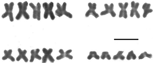
Figure 5. Girardia schubarti : pentaploid 5n=20 ; irrational multiple ( \lambda=2.5 ) of an original homeostatic 2n=8 complement presenting metastatic 5n sequence of n=4 -aggregate of chromosomal morphologic forms (scale bar=10 \mu\text{m} ).

a specimen, thus having an “off ploidy” (Pavelka et al., 2010), all chromosomal plates presenting numerically irrational multiples of that “off ploidy” (e.g. 3n , 6n ) are combined and analyzed as a homologous entity with the predominant polyploidy being the divisor in total percentage calculations. Thus a specimen presenting 54 total plates where 5 plates= 2n , 42 plates= 3n , 4 plates= 4n and 3 plates= 6n , polyploids 3n and 6n are scalar multiples “ 1x ” and “ 2x ” respectively of irrational ( 2n \times 1.5=3n ) yielding off ploidal polyploid 3n . The number of 3n plates= 42 and the number of 6n plates= 3 \times 42+3=45 total “off ploidal” count. Diploids 2n and polyploids 4n are rational scalar multiples “ 1x ” and “ 2x ” of diploid 2n . As the number of 2n plates= 5 and the number of 4n plates= 4 ; thus \Sigma 5+4=9 (homeostatic diploid and polyploidy). Polyploid plates 3n+6n=45 predominate; thus 45/54=0.83x(n=4)=3.33+(2n=8)=11.33=P.V.