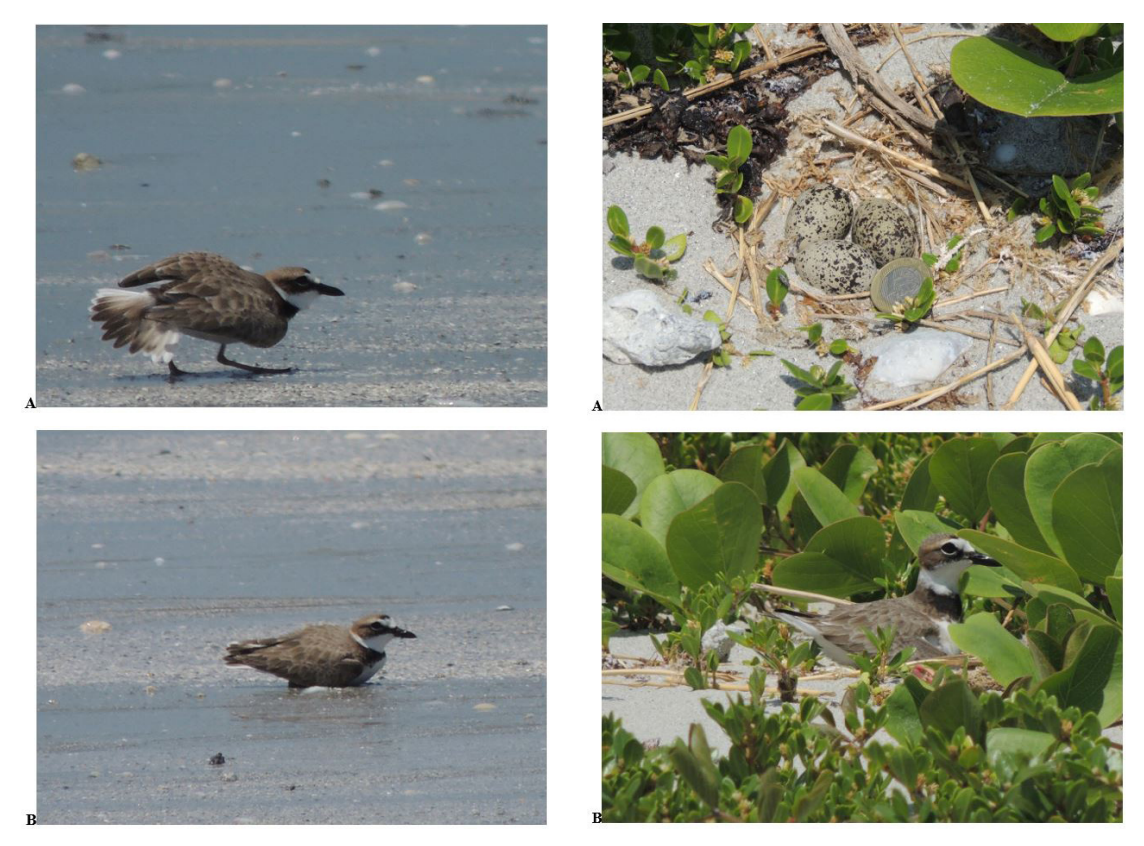
Figure 2. Broken-wing display in Charadrius wilsonia on Coroa do Avião Island, Igarassu, Brazil.