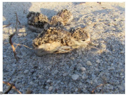
Figure 4. Nest of Charadrius wilsonia and chicks in the estuary of the Camurupim and Cardoso rivers, Cajueiro da Praia, Brazil.