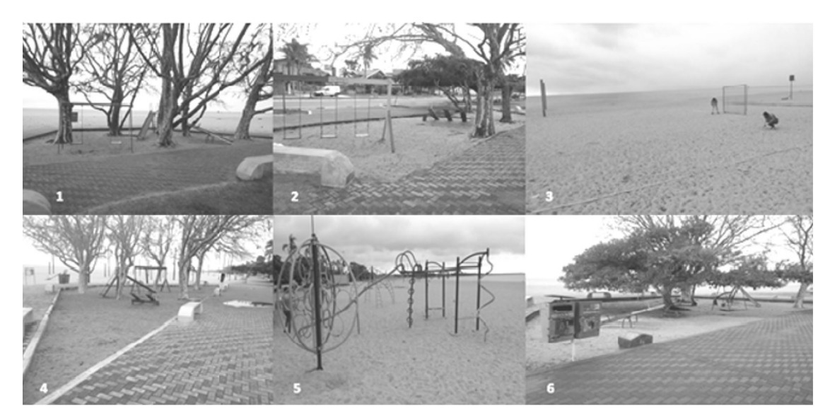
Figure 2. Six squares on the shore of Laranjal beaches, in the Laguna dos Patos, Pelotas, RS, Brazil, where parasites were evaluated in the soil.