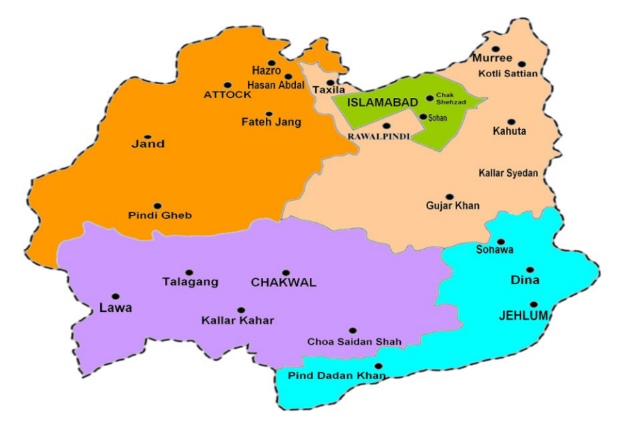
Figure 1. Map of Pothwar region of Pakistan.

positive samples by applying the following proportionate test (Steel and Torrie, 1980) (Equation 1).