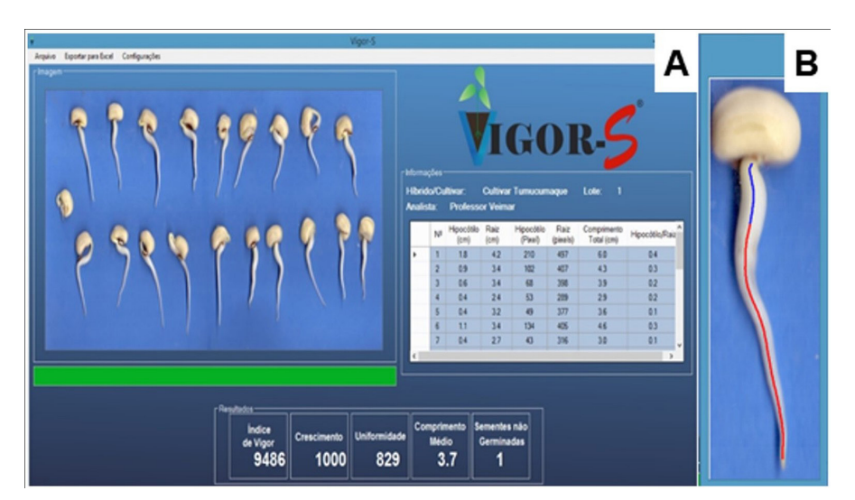
Figure 2. Screen of the Vigor-S<sup>®</sup> analysis system software with a cowpea sample (BRS Tumucumaque) two days after sowing the germination test (A); seedling detail identifying the primary root (red) and the hypocotyl (blue) (B).

The first component explained 29.1% data variability, while the second explained 22.6% and the third explained 29.1%, adding up to 80.8% of the total samples. In this sense, it can be considered that the two-dimensional plot presented here is adequate to assess the relationships between the variables, since it explains a large part of the data variability – it is usually a sun greater than 50%, in the sum of the components, is considered adequate to use the map (two-dimensional plot).