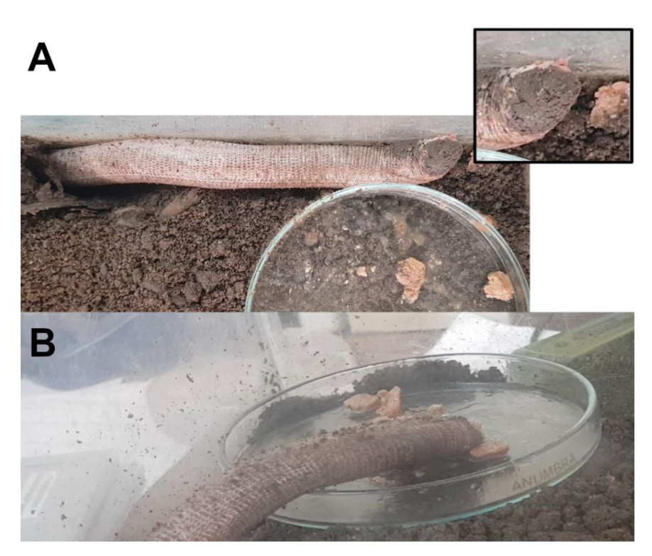
Figure 1. Images showing the different phases of the capture of food by Leposternon microcephalum : (A) Foraging and Detection –displacement, with head movements and tongue flicking, and (B) Contact and Capture – capture and ingestion of the food using the mouth. In detail, the bifid tongue.