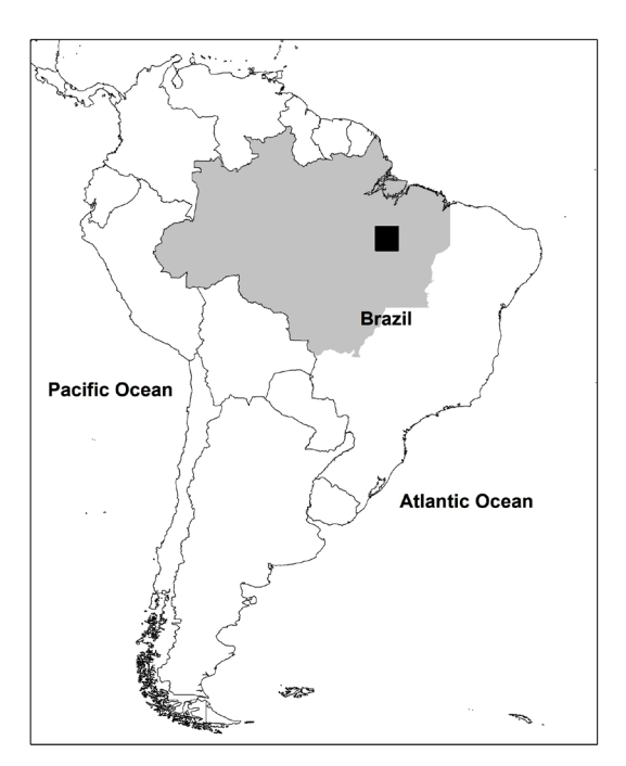
Figure 1. Location of study area, indicated by symbol, in Amazon rainforest (stippled area), Brazil.

The roadkill animals were collected in two conservation units, Carajás National Forest (6º4'14.972" S, 50º4'6.886" W) and Tapirapé Aquiri National Forest (5°35'52" and 5º57'13" S, 50°01'57" and 51°04'20" W), both located in the Amazon rainforest, Southeastern of the State of Pará, Brazil. These are part of a mosaic of protected areas, in the municipality of Parauapebas, state of Pará, Brazil (Figure 1). The predominant vegetation is classified as open ombrophilous forest, with local variations, associated with changes in relief. The dense ombrophilous forest