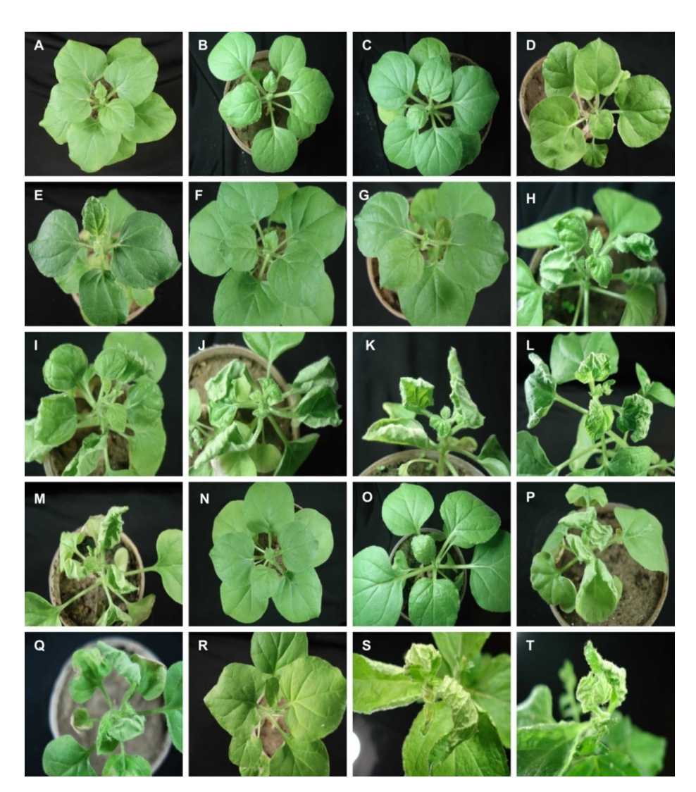
Figure 1. Symptoms exhibited by Nb plants upon inoculation with ToLCNDV, its CP gene mutant, along with DNA satellites. The shown Nb plants were either un-inoculated (healthy; A) or inoculated with TA (B), TA^{\Delta CP} (C), TA and C \alpha (D), TA^{\Delta CP} and C \alpha (E), TA and C \beta (F), TA^{\Delta CP} and C \beta (G), TA and TB (H), TA^{\Delta CP} and TB (I), TA, TB and C \beta (J), TA^{\Delta CP} , TB and C \beta (K), TA, TB and C \alpha (L), TA^{\Delta CP} , TB and C \alpha (M), TA, C \beta and C \alpha (N), TA^{\Delta CP} , C \beta and C \alpha (O), TA, TB, C \beta and C \alpha (P), TA^{\Delta CP} , TB, C \beta and C \alpha (Q), TA and C \beta (before inoculation of TB; R), TA and C \beta (after inoculation with TB; S), TA and C \alpha (before inoculation (D) and after inoculation with TB (T). Photographs from panel A-to-R were taken at 25 dpi, whereas photographs S and T were taken at 40 dpi.

Agrobacterium-mediated inoculation of ToLCNDV (TA and TB) induced severe infection in Nb plants and all the inoculated plants exhibited vein thickening and leaf curling (upward) symptoms at 12 dpi (Figure 1; Table 2). The induced symptoms progressed subsequently to severe stunting in growth as compared to non-inoculated plants (Figure 1). This infection was readily detectable in the