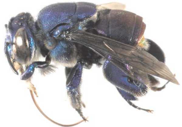
Figure 3. Lateral habitus of E. cognata male, from the Platina Basin.

Figura 2. Vista frontal do macho de E. cognata da Bacia Platina, exibindo o tegumento azul escuro na face no vértice, clipeo completamente azul, mandíbulas com manchas branco-marfim, mas com dentes enegrecidos, e dois pequenos pontos translúcidos.