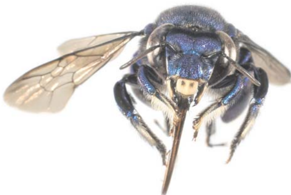
Figure 2. Frontal view of E. cognata male from the Platina Basin, showing the dark bluish tegument on the face and vertex, completely blue clypeus, cream white mandibles but black teeth, and two small translucent spots

Figura 1. Área aveludada da face externa da tíbia mesotorácica com apenas um coxim, em forma de vírgula, uma característica peculiar dos machos de E. cognata . Redesenhado de Moure (1970).