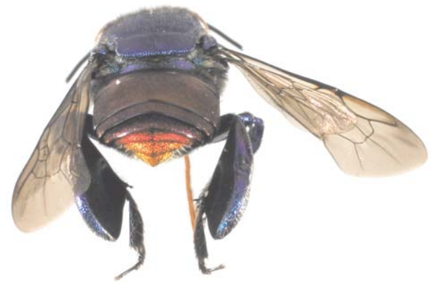
Figure 4. Rear view of E. cognata male from the Platina Basin, showing the colors of the terminal segments.

Figura 3. Hábito lateral do macho de E. cognata , da Bacia Platina.