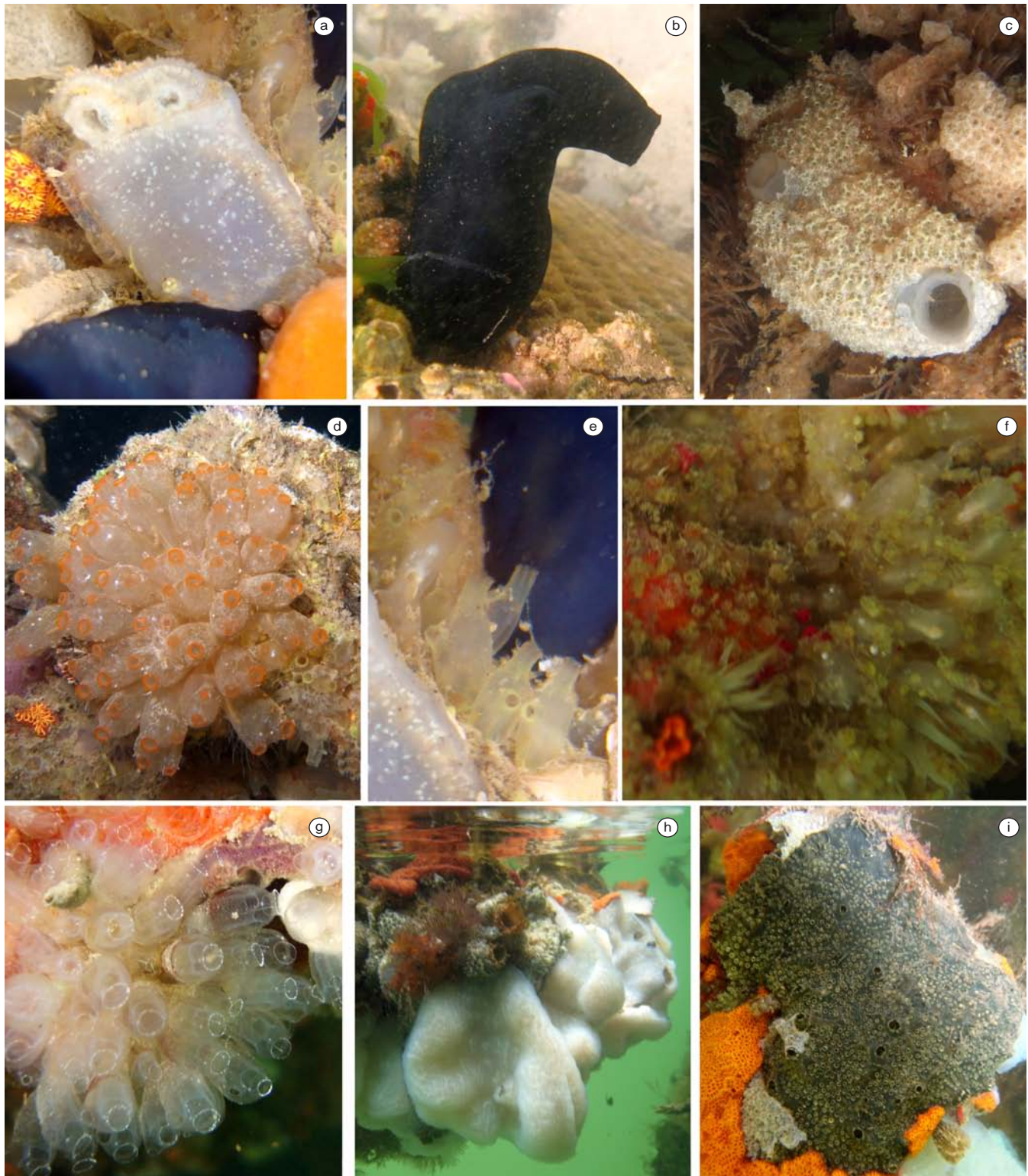
Figure 2. a) Rhodosoma turcicum (Savigny, 1816); b) Phallusia nigra Savigny, 1816; c) Ascidia curvata (Traustedt, 1882) covered by Symplegma brakenhielmi ; d) Ecteinascidia turbinata Herdman, 1880; e) Ecteinascidia styloloides (Traustedt, 1882); f) Perophora viridis Verrill, 1871; g) Clavelina oblonga Herdman, 1880; h) Aplidium accarense (Millar, 1953); i) Polyclinum constellatum Savigny, 1816.