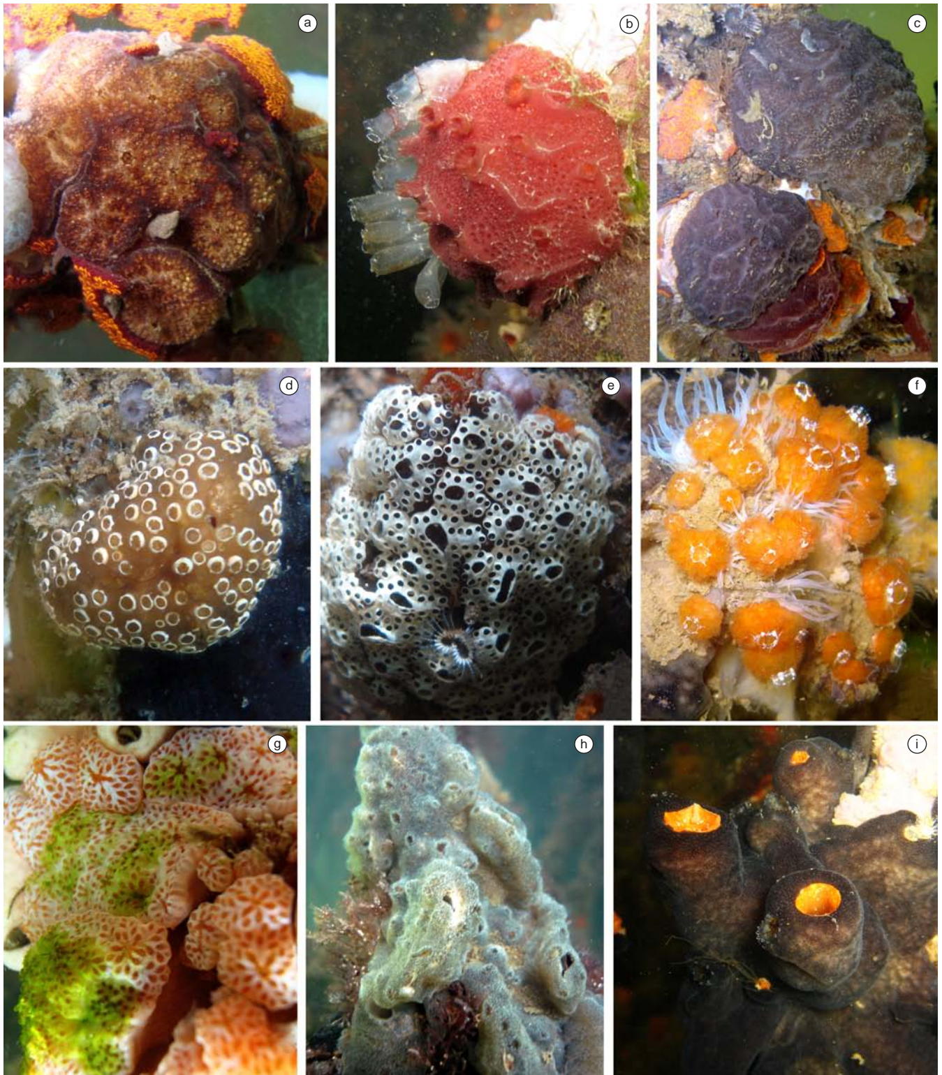
Figure 3. a, b, c) Polyclinum constellatum Savigny, 1816; d, e) Distaplia bermudensis Van Name, 1902; f, g) Distaplia stylifera (Kowalevsky, 1874); h) Diplosoma listerianum (Milne-Edwards, 1841); i) Didemnum cineraceum (Sluiter, 1898).