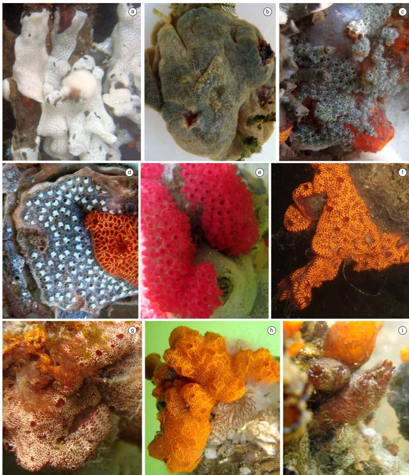
Figure 4. a) Didemnum perlucidum Monniot, 1983; b) Trididemnum orbiculatum (Van Name, 1902); c,d) Symplegma brakenhielmi (Michaelsen, 1904); e) Symplegma rubra Monniot, 1972; f, g) Botrylloides nigrum (Herdman, 1886); h) Botrylloides sp.; i) Styela canopus Savigny, 1816.