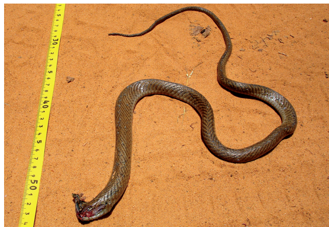
Figure 1. Snake ( Philodryas patagoniensis ) preyed upon by the Laughing Falcon in Estação Ecológica de Itirapina.

25/01/2000. Prata municipality, Parque Florestal Salto e Ponte III (19° 10' 12" S and 48° 48' 19" W). At 17:28 hours, approximately 12 Yellow-headed Caracara and one White-tailed Hawk were observed by JCMJ hunting winged termites (Termitidae) and catching them directly in their bills during flights above a gallery forest. No agonistic behaviour was observed between the raptors. This event and the swarming of the winged termites occurred soon after a short rainfall. In spite of the size of these raptors (315-335 g for Yellow-headed Caracara and 850-884 g for White-tailed Hawk, (see Thiollay 1994, White et al. 1994) several bouts were observed on those tiny preys. This