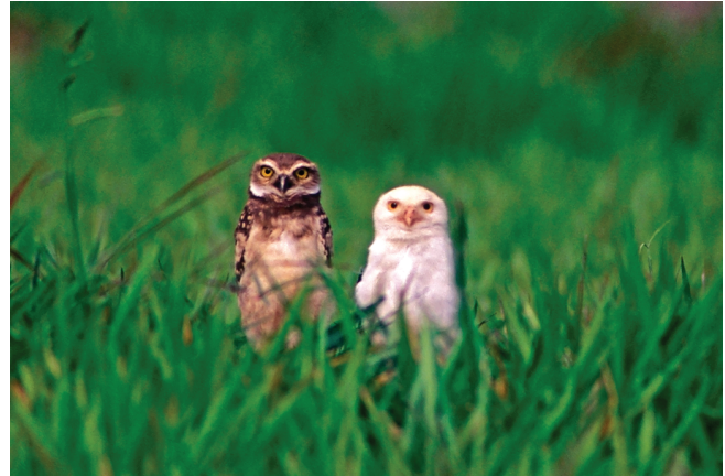
Figure 3. Leucistic Burrowing Owl besides its normally pigmented mate. Note normal pigmentation on bare parts of bill and in the eyes.

November - December 1996. Chácara Mattos, São Carlos municipality (22° 00' S and 47° 55' W). During this month JCMJ observed a leucistic Burrowing Owl living along with other normally pigmented individual (Figure 3) in disturbed grassland surrounded by Pinus plantations and suburbs of the city. The