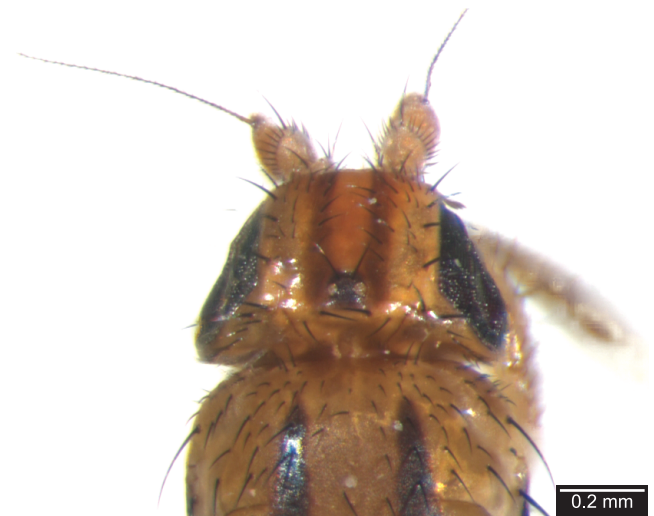
Figures 1. Pseudopomyzella flava Hennig 1969, female. Head (dorsal view), scale bar 0.2 mm.

Thorax: Dull yellow, two dark brown stripes in dorsal view, extending posteriorly from the anterior margin of the scutum to the scutellar apex (Figure 2). Pleura yellow, except for a dark spot on the superior margin of the anepisternum. Chaetotaxy: 0+1 acrostichals, 1+4 dorsocentrals, 1 postpronotal, 2 notopleurals, 1 presutural intralar (in anterior part of scutum), 1+3 supra-alars, 1 basal scutellar, 1 subapical scutellars, 1 strong laterally flattened apical scutellar; 1 proepimeral, 1 anepisternal; 1 katepisternal; anepisternum and katepisternum covered with setulae. Legs: Femora yellow, hind