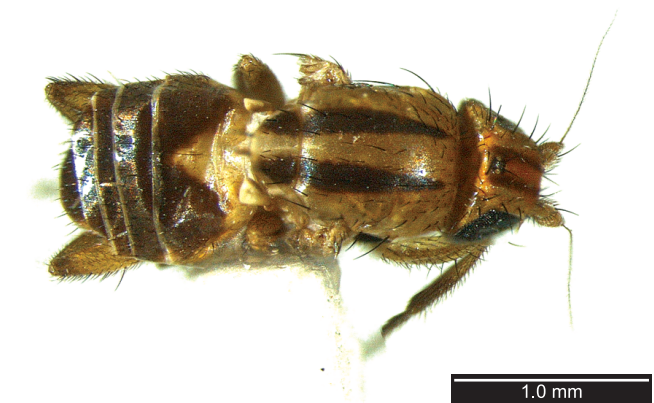
Figure 2. Pseudopomyzella flava Hennig 1969, female. Habitus (dorsal view), scale bar 1.0 mm.

Figuras 1. Pseudopomyzella flava Hennig 1969, fêmea. Cabeça (vista dorsal), escala 0,2 mm.