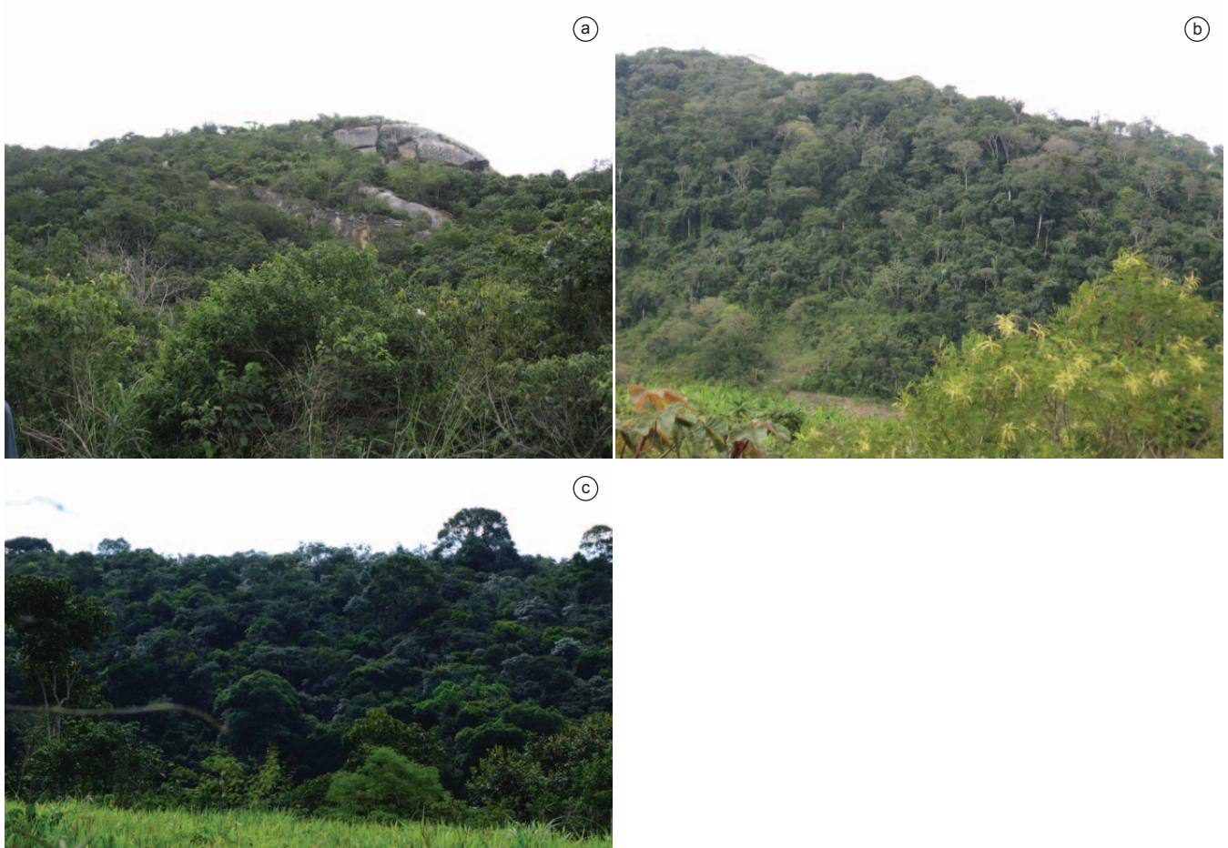
Figura 1. Imagens de alguns Brejos amostrados neste estudo. a) Brejo do Pico do Jabre , Maturéia, Paraíba; b) Brejo do Pau Ferro , Areia, Paraíba; c) Brejo de Goiamunduba , Bananeiras, Paraíba.

Figure 1. Pictures of some of the enclaves sampled in the present study. a) Brejo Pico do Jabre , Maturéia, Paraíba; b) Brejo do Pau Ferro , Areia, Paraíba; c) Brejo de Goiamunduba , Bananeiras, Paraíba.