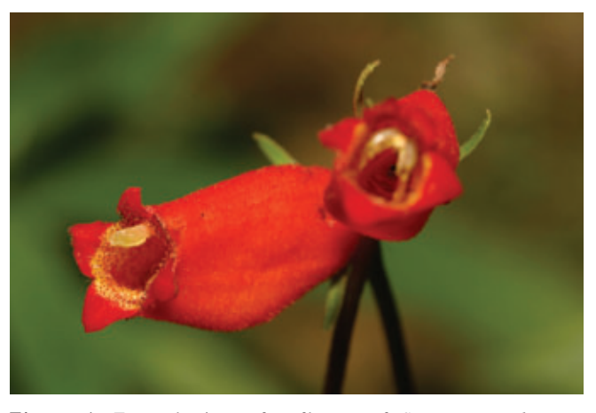
Figure 1. Frontal view of a flower of Seemania sylvatica (Kunth) Hanstein (Gesneriaceae). Note the presence of tricomes in the entrance of the corolla tube, and the enlargement (gibbus) in its middle portion.

The flowers of S. sylvatica are protandrous, being functional male in the first four days of anthesis. The female phase begins on the fifth day. During the five days of observations the flowers were