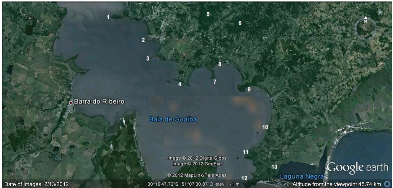
Figure 1. Location of the study area and main hills and patches of forest that compose the landscape on the edge of Guaíba Lake (Google Earth 2012). 1. Ponta Grossa, 2. Ponta da Cuíca, 3. Ponta do Arado, 4. Ponta das Canoas, 5. Morro São Pedro, 6. Morro da Extrema, 7. Ponta do Cego, 8. Reserva Biológica do Lami José Lutzenberger, 9. Morro do Coco, 10. Parque Estadual de Itapuã, 11. Morro da Fortaleza, 12. Ponta de Itapuã, 13. Morro da Grota.

1991, Borges & Tomaz 2008, Carvalho Junior & Luz 2008) and by consulting specialists. Ten local inhabitants were interviewed with the aim of confirming and complementing the visual and track recordings, utilizing a questionnaire adapted from Santos (2001). Recordings were considered valid only if confirmed by at least two inhabitants in a period of five years, accompanied by a detailed description, followed by the identification of the animal from a photograph.