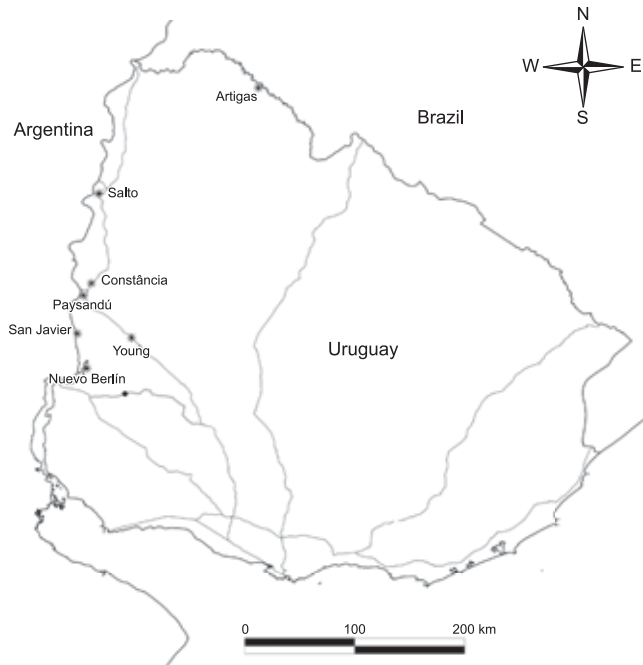
Figure 3. Records of Latrodectus geometricus in Uruguay: urban localities (asterisk) and route (black circle). Grey lines: main routes of the country.