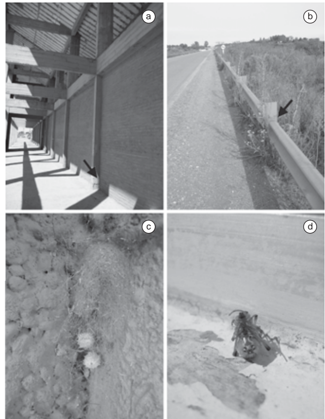
Figure 4. Latrodectus geometricus in Uruguay: a) arrow indicating a wall crevice, one site where individuals of this species can be easily found; b) arrow indicating a containment barrier at the side of road, another habitat of the species; c) the web, showing the retreat and two egg sacs; d) specimen exhibiting thanatosis.