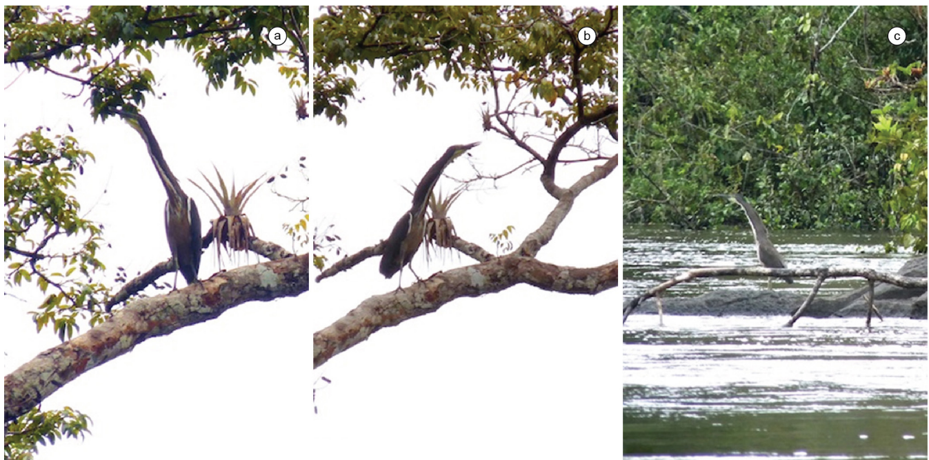
Figure 2. Tigrissoma fasciatum on a tree branch (a-b) and on a rock (c) in the Araguari River, in the National Forest of Amapá (FLONA-AP), state of Amapá, Brazil. Images show details of characteristic plumage patterns and culmen shape. Photos: Lia N. Kajiki, 29 April 2012.

*Wikiaves ( http://www.wikiaves.com/ ). **Internet Bird Collection (IBC) ( http://ibc.lynxeds.com/ ). ***Personal website ( http://www.surinamebirds.nl ).