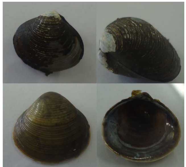
Figure 3. Record of Corbicula largillierti , reservoir Epitácio Pessoa, Paraíba River basin, Brazil.

The introduction of the mollusk in the study reservoir may have happened due to a variety of reasons. Given the higher densities near entry points of tributary streams into the reservoir, we believe that the mollusk was carried into the reservoir from these affluent tributaries. An alternative is that Corbicula largillierti may have been brought along with exotic molluscivorous fish that have been introduced into the reservoir (Gurgel & Fernando 1994). It is known that some species of