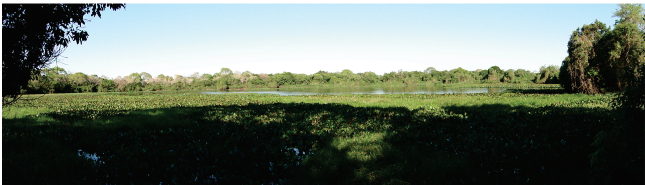
Figure 2. View of Baía da Medalha on Miranda-Abobral Pantanal subregion, in September 2011.

A total of 97 species were recorded (Table 1), representing about 40% of Pantanal fish species (Britski et al. 2007). Resende (2000) recorded 101 fish species belonging to 20 families addressing four floodplain environments in the Miranda River Basin. Catella (1992) recorded a total of 75 species in a pond during the dry season in the Aquidauna subregion, which represents the eastern boundary of the Pantanal. During the same season, Baginski et al. (2007) recorded 95 species in communities of 15 lakes in the floodplain of the Cuiabá River, and Suárez et al. (2001) found a total of 51 fish species in 19 ponds in the Nhecolândia subregion,