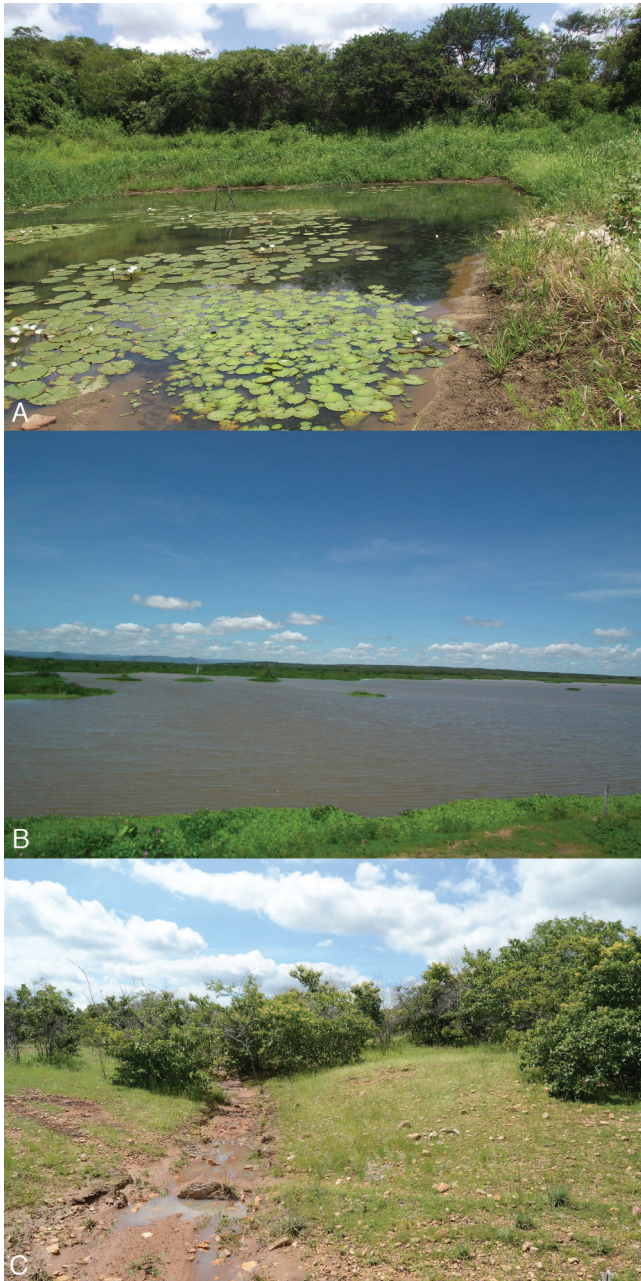
Figure 2. Landscapes in the Middle Jaguaribe River region, State of Ceará, northeastern Brazil, and some examples of sampled habitats: A = permanent pond in Serra do Barro Vermelho; B = Santana Dam near the survey site 2; C = temporary stream in a Caatinga area at Mr. Alzir Farm.

and with small temporary ponds). Each study site was surveyed by at least five researchers simultaneously. Our field inventory methods followed the “Complete Species Inventories”, “Visual Encounter Surveys”, and “Audio Strip Transects” guidelines of Heyer et al. (1994).