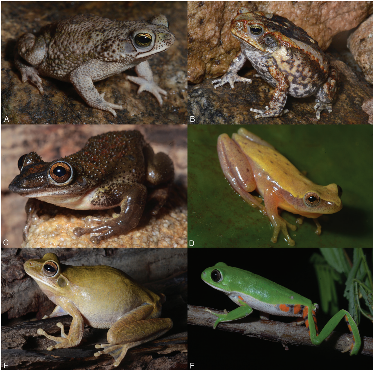
Figure 3. Anurans registered at the Middle Jaguaribe River region, Ceará State, northeastern Brazil: A = Rhinella granulosa (AAGARDA 10216); B = Rhinella jimi (AAGARDA 10292); C = Corythomantis greening (AAGARDA 10391); D = Dendropsophus nanus (AAGARDA 10276); E = Hypsiboas raniceps (AAGARDA 10404); F = Phyllomedusa nordestina (individual not collected).