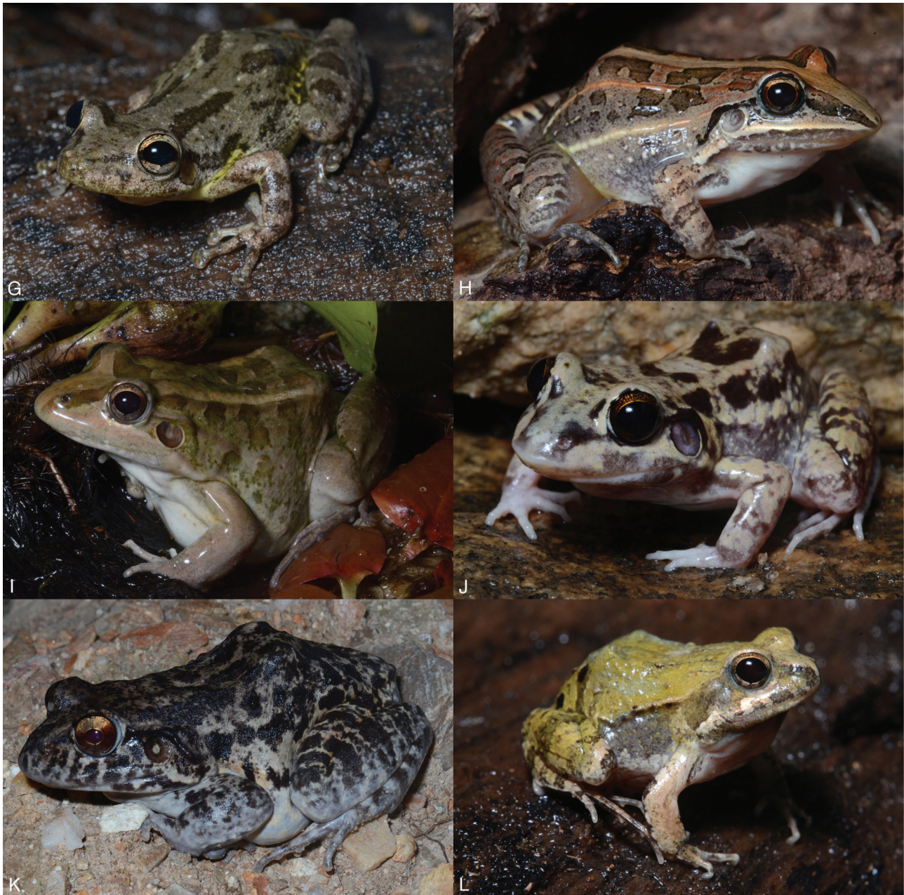
Figure 3 (continued). Anurans registered at the Middle Jaguaribe River region, Ceará State, northeastern Brazil: G = Scinax x-signatus (AAGARDA 10241); H = Leptodactylus fuscus (AAGARDA 10336); I = Leptodactylus macrosternum (AAGARDA 10188); J = Leptodactylus troglodytes (AAGARDA 10282); K = Leptodactylus vastus (AAGARDA 10339); L = Physalaemus albifrons (AAGARDA 10254).

these spots are located in the northeastern region of the Ceará State – the most impacted area in the state by human activities – and also in close contact with coastal lowland regions.