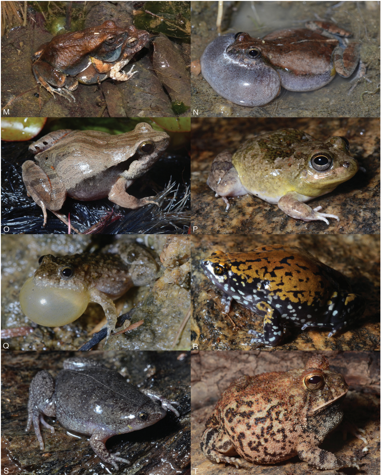
Figure 3 (continued). Anurans registered at the Middle Jaguaribe River Region, Ceará State, northeastern Brazil: M = couple of Physalaemus cicada (AAGARDA ); N = Physalaemus cicada (AAGARDA 10329); O = Physalaemus cuvieri (AAGARDA 10394); P = Pleurodema dipolister (AAGARDA 10349); Q = Pseudopaludicola pocoto (AAGARDA 10335); R = Dermatoneotus muelleri (AAGARDA 10209). Anurans registered at the Middle Jaguaribe River region, Ceará State, northeastern Brazil: S = Elachistocleis piauiensis (AAGARDA 10251); T = Proceratophrys cristiceps (AAGARDA 10401).