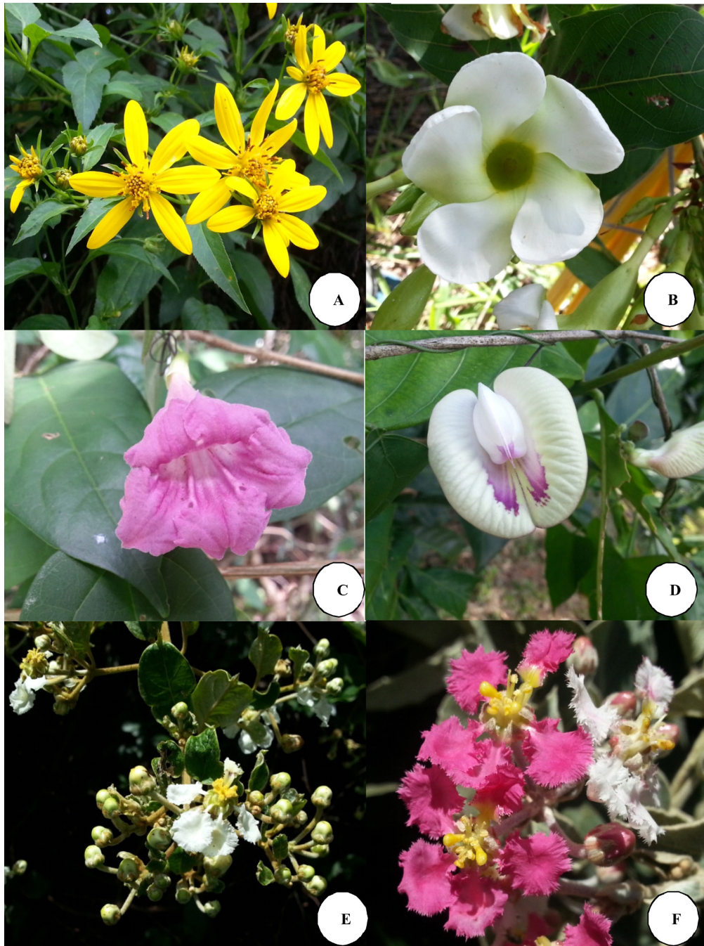
Figure 2. A. Bidens segetum ; B. Odontadenia lutea ; C. Fridericia craterophora ; D. Centrosema sagittatum ; E. Banisteriopsis argyrophylla ; F. Banisteriopsis adenopoda.