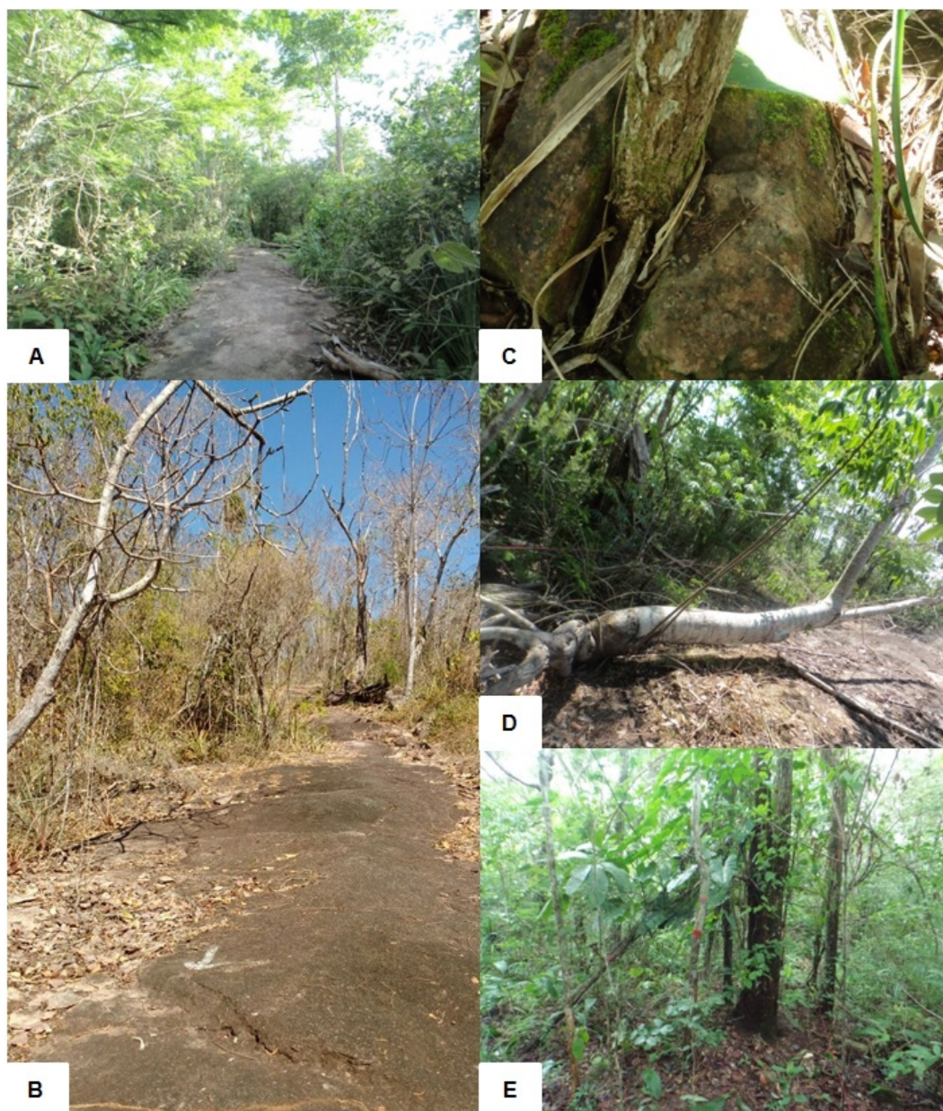
Figure 2. Aspects of the Deciduous Seasonal Forest associated with rocky outcrop in the RPPN Mirante da Serra, Cristalino Region, Southern Amazon, Mato Grosso, Brazil. A: Study area in the rainy season. B: Study area in the dry season. C: Saxicolous Tree. D: Rocky outcrop Tree. E: Arboreal individuals in shallow soil.

Among the 20 species of Fabaceae recorded in the investigated area, 10 belong to the Papilionoideae subfamily. Therefore, at least 50% of Fabaceae can be potential nitrogen-fixing potentials whether we consider the classic classification as well as the new classification (LPWG 2017) that divides legumes into six subfamilies. On the other hand, the scarcity of studies conducted on deciduous forests associated with rocky outcrops hampers comparisons with more similar areas. Indeed, there is a poverty of data from rocky outcrops in Brazilian Amazon as a whole (Silva 2016). One of the few studies in this regard, which was not conducted in Amazon or Cerrado-Amazon transition, but in the core area of Cerrado, found the same pattern of high floristic relevance of Fabaceae (Felfili et al. 2007). In other locations in South