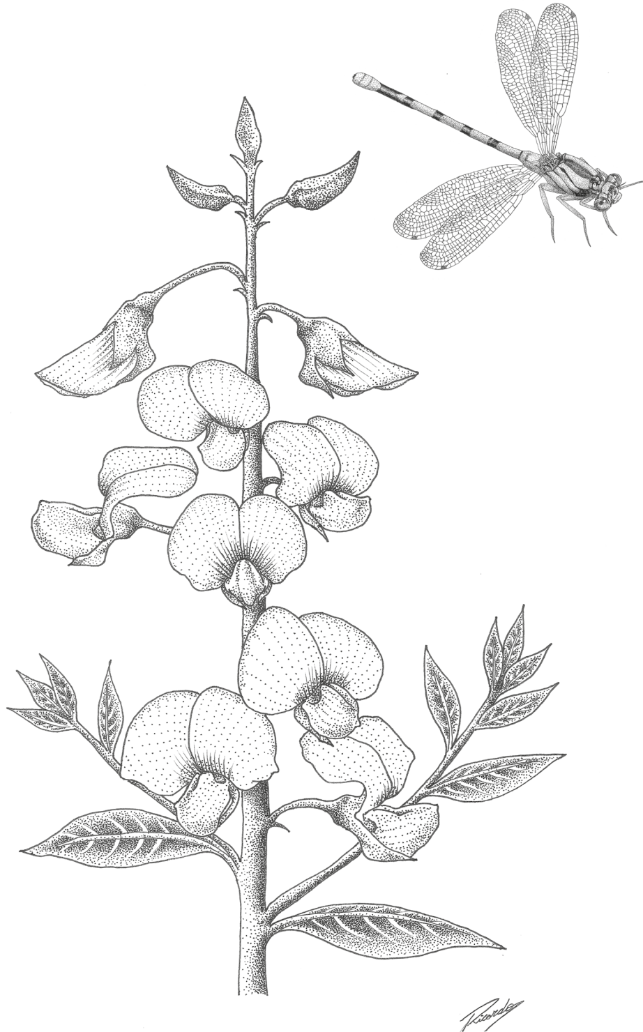
Figure 1. Illustration of a damselfly from the genera Argia spp. (Zygoptera) and one individual of Crotalaria genera ( Crotalaria juncea).